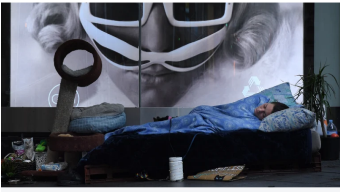
Homelessness increased between the 2016 and 2021 censuses but the proportion of Australians without adequate housing fell. KATI

While the proportion of people in homelessness fell, there was a 10 per cent increase in the number of women without proper accommodation to more than 53,000.