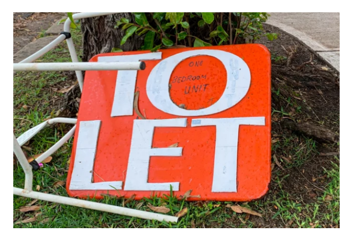
The rental market has been broken for years, for both renters and landlords, a new report shows. PETER RAE

Analysis released on Thursday by financial and property services companies LongView and PEXA shows 60 per cent of landlords are receiving lower returns on their properties compared to an ordinary balanced super fund.